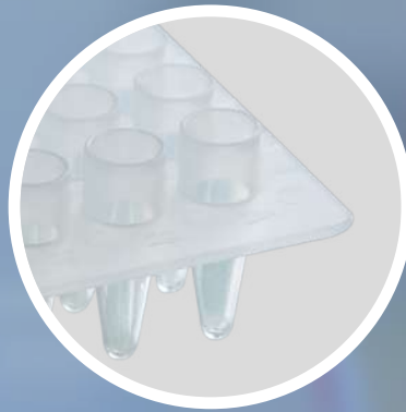
NON-SKIRTED ELEVATED WELL PLATE