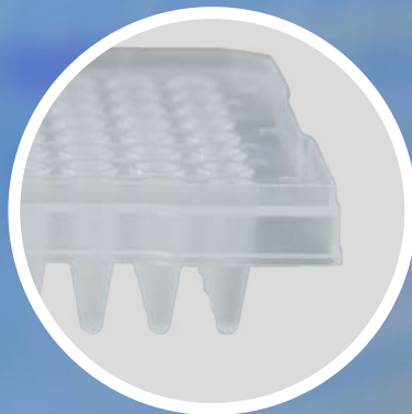
ELEVATED SKIRT PLATE