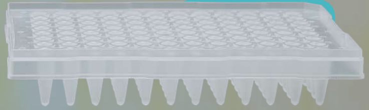
HIGH PROFILE (0.2ML) PLATE